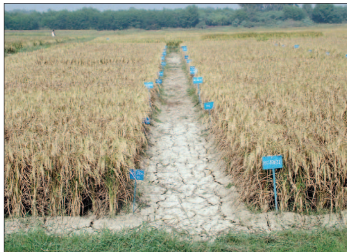
View of research plots.

ment. The initial soil pH was 8.2. New Delhi has a semi-arid and sub-tropical climate with hot and dry summers and cold winters. The mean annual rainfall is about 710 mm, most of which (about 84%) is received between July and September.