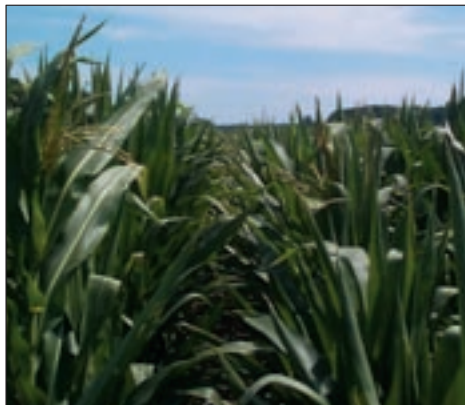
High oil corn receiving fall K plus starter K (at left) showed a height advantage and higher yields compared to the zero K plot (right) at Davis-PAC.

Both soil series and SEK concentrations accounted for most of the within-field variability in HOC performance. Higher SEK concentrations were consistently associated with increased concentrations of ear-leaf K