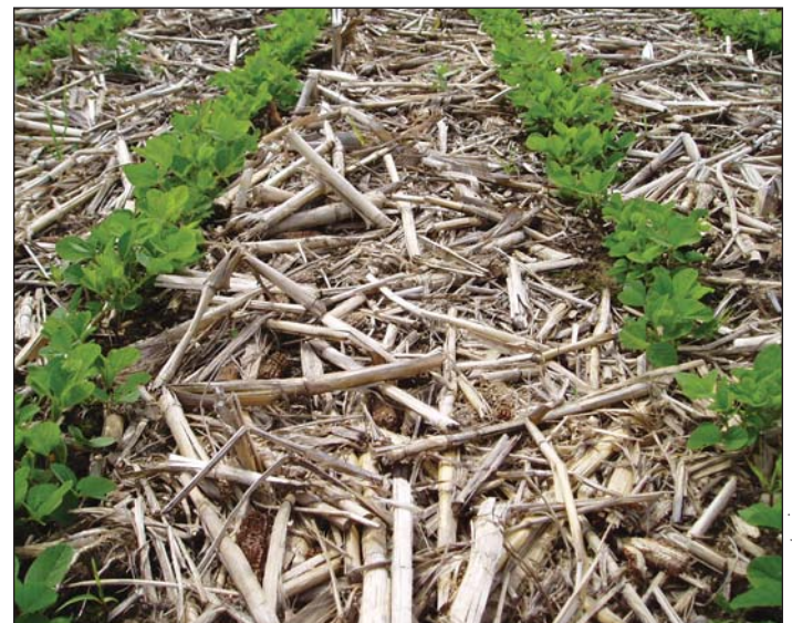
Use of minimum tillage will reduce the potential for erosion, but more soil acidifying processes (like crop residue decomposition, nitrification of N fertilizers, etc.) occur at the soil surface.

No-till (also called zero tillage or conservation tillage) is a way of growing crops or pasture from year-to-year with minimal physical soil disturbance. It usually promotes an increase in organic matter retention, modifies macro and micro soil porosity, and also influences the cycling of nutrients. In many