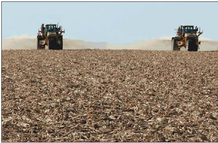
Application of lime at a large scale using commercial equipment.

Excess soil acidity is a major problem in large areas of the globe, especially in highly weathered soils of the tropics, in low-yielding pasture lands, and marginal soils. The capacity of plants to tolerate soil acidity varies, but most plants grow better under slightly acidic soil conditions (pH from 5.5 to 6.5). For example, rice plants grow well in soil pH as low as 4.8; maize typically does best between 6.0 to 6.5; alfalfa grows better if soil pH is near 7.0. Even in highly productive soils, acidification may take place due to leaching of base cations and use of N fertilizers. Monitoring soil acidity with periodic soil analysis and use of lime will prevent the loss of soil quality associated with acidification, especially at depth where soil properties are harder to correct. Liming also can help to bring more soils into high-yielding agricultural production. In some cases, gypsum may be used to alleviate the problems of excess Al^{3+} and lack of Ca^{2+} in the subsoil, thus allowing deep root growth, which is important for the absorption of water and nutrients below the surface soil layers.