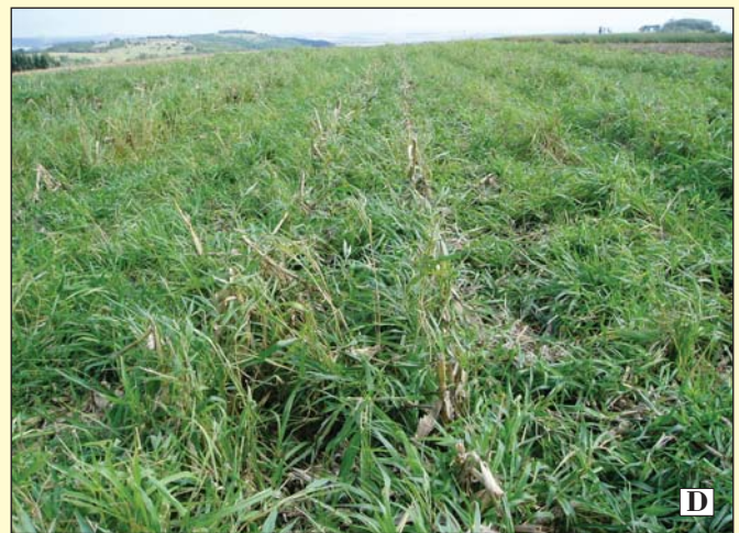
Figure 3. Examples of brachiaria grass used with corn – seen at different stages: (A) before harvest, (B) at harvest, (C) soon after harvest, and (D) some weeks after harvest.

regions it can reduce or eliminate soil erosion. As a result of such modifications, no-till can positively influence soil conditions such as aeration, heat and soil permeability. It may also influence nutrient and water availability, all of these leading to better conditions for plant growth.