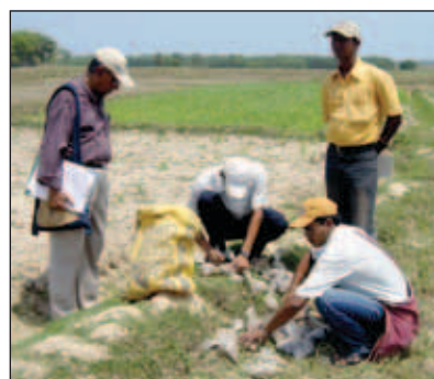
Collecting soil samples within the fragmented landscape of the village of Meherpur, West Bengal.

To arrive at a cost effective grid size of sampling, researchers compared actual soil analysis values of pH, organic C and available P and K contents of random samples from the study area with values predicted from GIS maps using 50, 100, and 250-m grids. Predicted soil fertility levels were classified into low, medium, or high categories according to existing norms (Ali, 2005). Variation existed for soil parameters values under the three grid sizes, but the deviations from the actual soil test