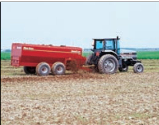
Livestock manure can provide some needed nutrients for crops, but transportation and balancing nutrient levels correctly are challenges.

Phosphorus enters water in many ways, both natural and through human activity. Agriculture is only one of the ways. But we are striving to fix our part of the problem. So, what are we doing? Right now, agricultural scientists, agencies, and industries are finding ways to work together to educate people about what we already know to be some of the best ways of managing nutrients...integrating manure and commercial fertilizer applications to better distribute nutrients in the environment while meeting plant and animal needs. And of course, there are many things we don't know yet about how all this works. For that, we conduct research to help find some practical approaches.