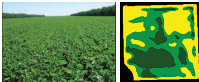
A sugarbeet production field as seen by eye (left) compared to the satellite-derived leaf color image on the right. (Source: ACSC).

Use of precision variable rate technology applied to management zones based on sugarbeet leaf color has been used effectively in eastern North Dakota and western Minnesota.