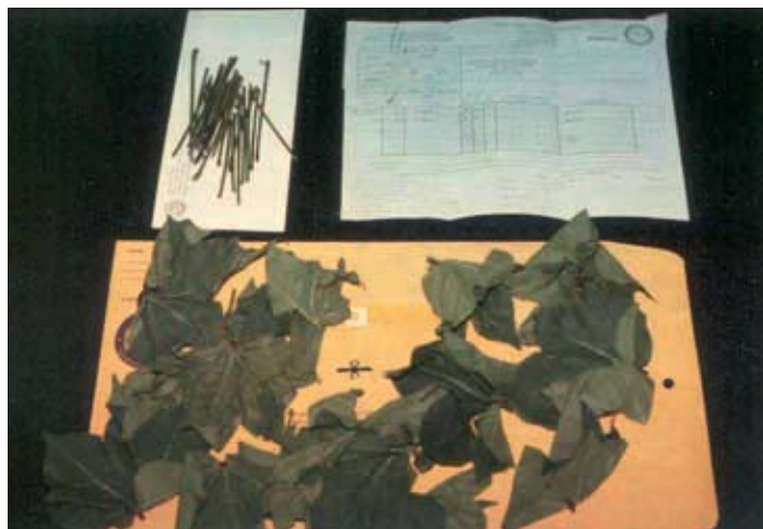
The sample contains at least 20 of the most recently mature and healthy-looking leaves from main stems, usually the leaf at the 4 th node from the plant terminal.

through experience and research, has established that a concentration of 3.5 to 4.5% N in the leaf blade is associated with optimal growth and yield. Overall, during the period summarized, 9% of all cotton samples contained too little N; 27% contained sufficient N; and 64% contained too much N (Table 1). The percentage of cotton samples with insufficient N ranged from a low of 3% in 1999 and 2002 to a high of 19% in 2006. Samples with sufficient N ranged from a low of 17% in 1999 to a high of 39% in 2001. Samples with too much N decreased to 50% in 2006, from a high of 80% in 1999. A decrease in excess application of N is favorable since excess N is an environmental concern because of the danger for leaching and runoff.