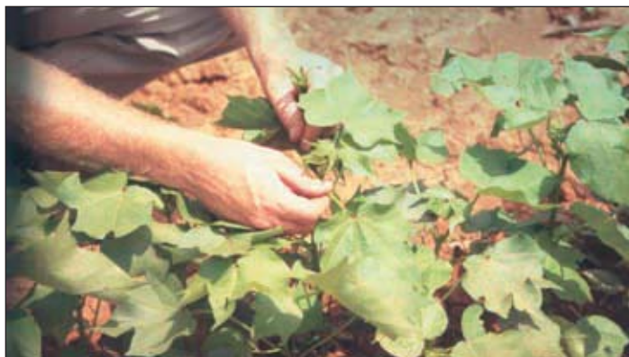
Plant tissue nutrient analysis and monitoring can identify deficiencies and opportunities for corrective action.

Leaf blade N provides information on N availability and uptake for the week or 2 weeks prior to sampling. NCDA&CS,