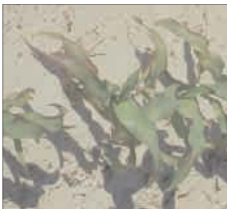
Phosphorus deficiency symptoms... purpling in leaves...are indicated on these corn plants.