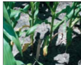
Nitrogen deficiency in corn.