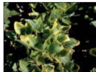
Potassium deficiency in soybeans.