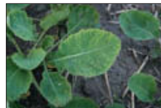
Sulfur deficiency in canola.