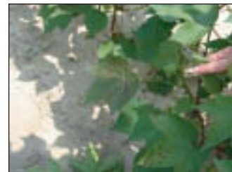
Phosphorus deficiency in cotton.