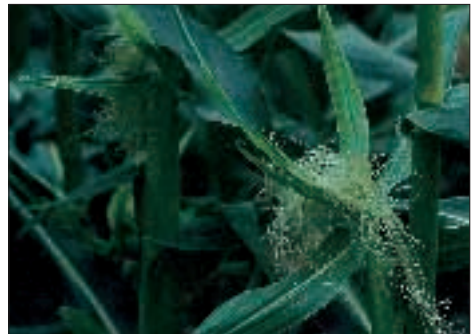
Adequate K nutrition offers benefits in development and maturity of corn, soybeans and other crops.

Potassium (K) influences crop maturity in different ways. It speeds silking in corn, but lengthens time of grain fill, thus increasing yield potential. Higher moisture at harvest in an adequate K environment indicates K stretches the growing season in corn. Potassium deficiency delays maturity in soybeans. With adequate K, cotton yields are increased by extending the boll-filling period and preventing premature senescence or “cutout”. The effects of K on maturity of fruits and vegetables are variable.