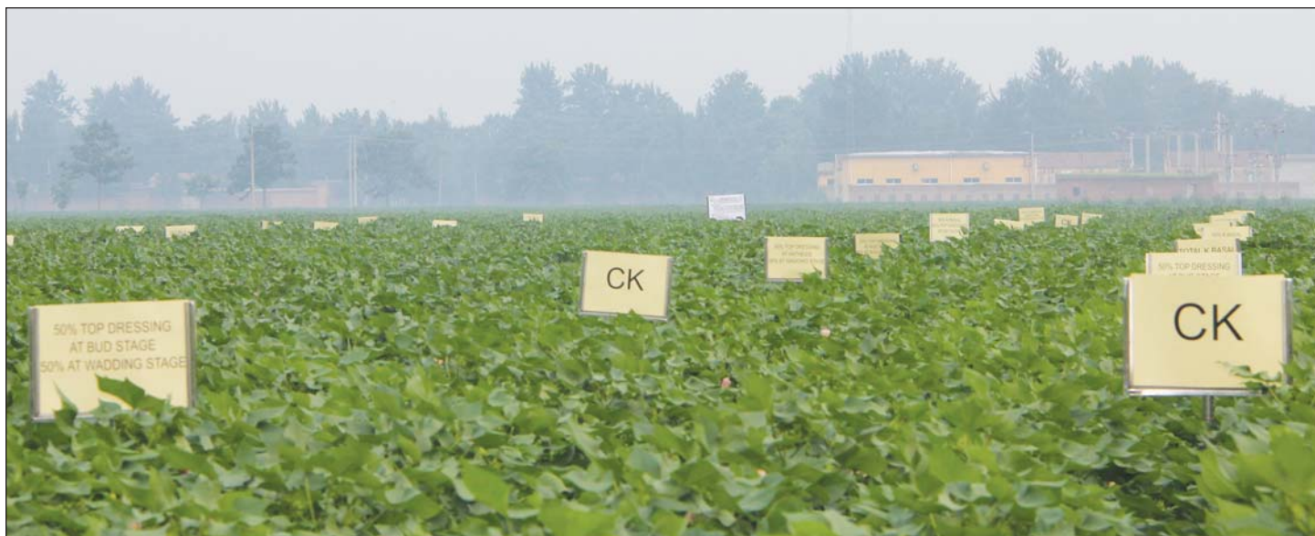
Plots comparing K application timings in cotton grown in northern China.

and the soil K status. In soils containing moderate amount of K, maintenance of existing K supplies may be a suitable goal. For example, for a target yield of 1,500 kg/ha on a medium-K soil, the recommended K application rate would range from 104 to 225 kg K 2 O/ha, which is about equal to the total plant K uptake when no crop residue is returned to the field. In some areas, the K application rate can be greatly reduced if the residues are returned since only 29 to 45 kg K 2 O/ha is commonly removed through harvested lint and seed. In soils with low amounts of K, a common recommendation is to apply enough K to meet the immediate cotton crop need, while adding an additional amount to build soil K concentrations. In the high-K soils of Xinjiang, the K application rate can be somewhat reduced from the recommended maintenance rate, depending on fertilizer cost.