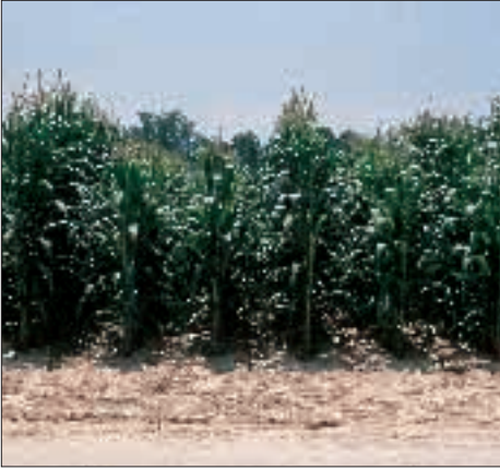
Subsurface microirrigated corn plots are shown here in Virginia research.