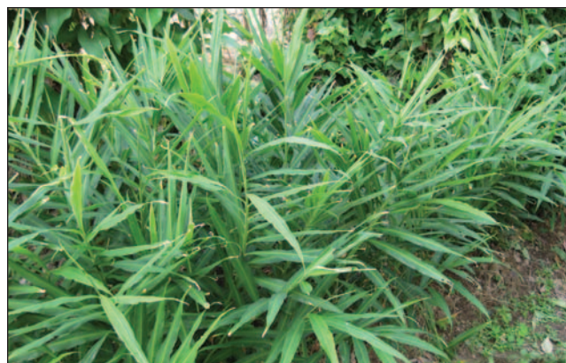
Ginger plants require large amounts of nutrients, especially K.