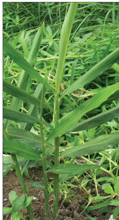
Studies in Anhui Province show benefits of soil testing to evaluate nutrient supply for ginger.

These results show that K is an important limiting factor for ginger production in Anhui. Ginger is sensitive to and needs a large amount of available soil K. Balanced use of fertilizers will improve rhizome yields and it contributes greatly to the economic viability of the crop. Profits were highest under this study's recommended K rates, and balanced fertilization of N and P were effective at supporting improved farmer profit. Soil testing used to evaluate soil nutrient supply also provided good guidance for avoiding over fertilization. BC