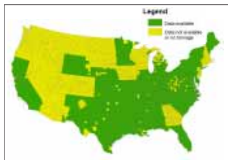
Figure 1. AAPFCO county fertilizer consumption data availability, 2005. (Prepared for PPI by PAQ Interactive.)