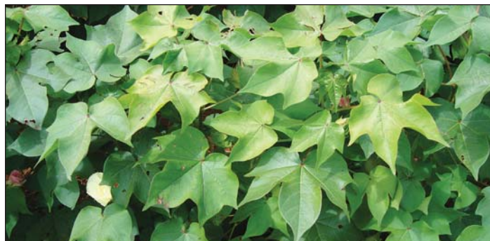
Initial K deficiency symptoms on a high yield cotton field.

The recommendations of N, P and K fertilizer rates for cotton are based on yield expectation and soil analysis ( Table 5 ) and may vary widely depending on different conditions. Nitrogen is a nutrient taken up in large amount by cotton, which depending upon the climate, cultivar, yield, soil conditions, and fertilizer rates can use 125 to 210 kg of N per tonne of lint produced (Carvalho et al., 2007). Due to its high mobility and dynamics in soil, farmers in the Cerrado have to take texture, OM content, crop rotation, and soil management into consideration to define the right N rate to be applied. In clay soils with high OM content (25 to 35 g/kg) under crop rotation and no-tillage, cotton will not be as responsive to N rate as it is in sandy soils low in OM (15 to 25 g/kg) or under annual tillage. The type of crop preceding cotton also matters to efficiently manage N fertilization (e.g., pasture or grasses with high C:N ratio may cause N immobilization during the early stages of cotton). Zancanaro and Tessaro (2006) suggest that N rates are managed as: 10 to 25 kg N/ha at planting as starter (in-furrow), 40% of recommended N rate at first square, and 60% at first