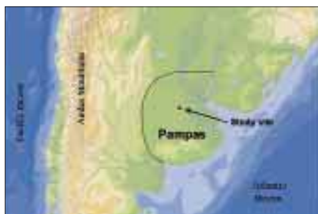
Figure 1. The Pampas region has great potential for intensive crop production.

Three field experiments were conducted during the 1998-1999 season, at the center of the Pampean Region ( Figure 1 ). Sites were located at Junin on a sandy loam soil with 5 parts per million (ppm) Bray P-1 and 14 ppm sulfate-S ( \text{SO}_4\text{-S} ), at Viamonte on a loam soil with 12 ppm P and 18 ppm \text{SO}_4\text{-S} , and at Obligado on a loam soil with 22 ppm P.