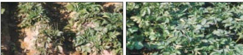
Potato crop without (left) and with (right) K application, Uttar Pradesh, India.

The two-year experiment was conducted on a farm field near Masoori in Uttar Pradesh in 1999 and 2000. Soil at the experimental site was Gangetic alluvium with sandy loam texture, pH 7.8, electrical conductivity (EC) 0.40 dS/m, organic carbon (C) 0.40 percent, available phosphorus (P) 6 parts per million (ppm), available K 75 ppm, and available S 4 ppm [0.15 percent calcium chloride (CaCl 2 ) extractable]. The experiment comprised 16 treatments including all combinations of four potato cultivars (Kufri Chandramukhi, Kufri Jyoti, Kufri Bahar, and Kufri Sindhuri), four levels of K (0, 60, 120, and 180 kg K 2 O/ha),