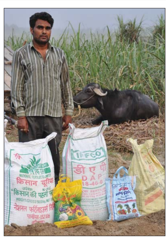
Farmer's choice of right sources of fertilizer application in sugarcane.

Abbreviations and notes: N = nitrogen; P = phosphorus; K = potassium; S = sulfur; Mg = magnesium; Cu = copper; Mn = manganese; C = carbon.