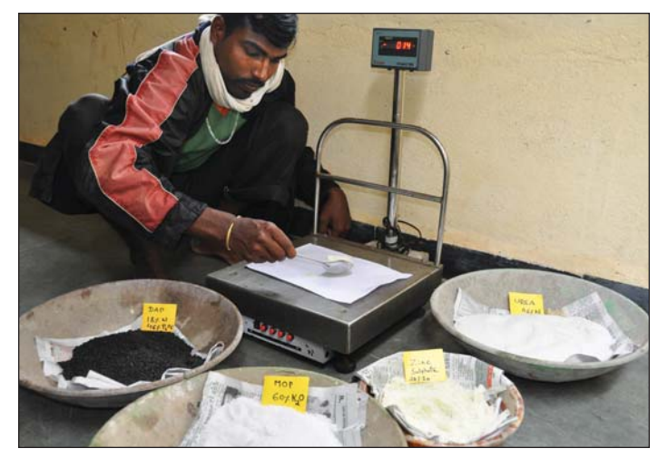
Farmer weighing exact amount for arriving at the right rate of application.

in tropical states compared to subtropical states. Saini et al. (2006) also reported that application of nutrients up to 400 kg N, 170 kg P_2O_5 , and 180 to 190 kg K_2O/ha is recommended for sugarcane depending upon its duration and fertility status of the soil. In several experiments, applied P did not influence yield or quality of sugarcane ratoon to an appreciable extent. This was due to the fact that in most of the cases the soils were high in available P status (Gopalasundaram et al., 2012). However, the need for phosphate application ranging from 30 to 100 kg P_2O_5/ha has been reported to maintain productivity.