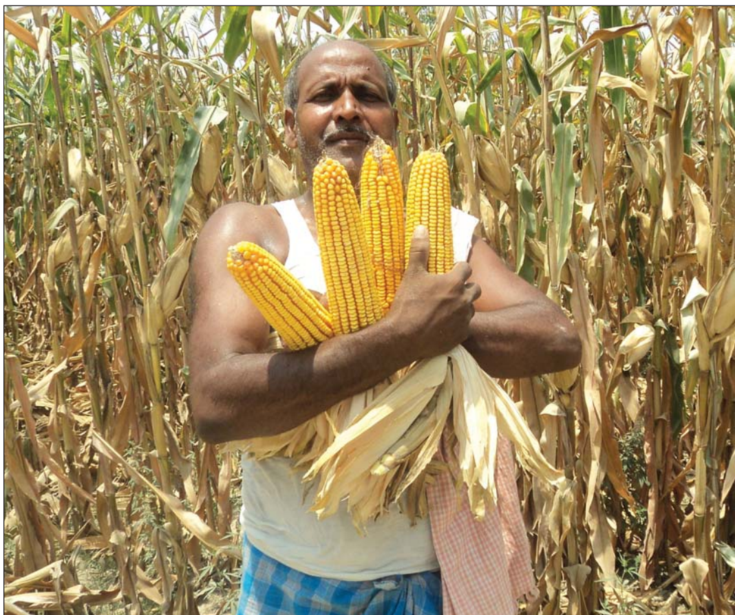
Bihar farmer proudly shows his excellent end result of implementing a Nutrient Expert® fertiliser recommendation.

ping systems. The tool integrates 4R Nutrient Stewardship principles (i.e., ensuring the right source is applied at the right rate, right time, and right place) into a fertiliser recommendation and suggests different levels of application rates based on varying target yields as well as growing environments. More importantly, it considers the environmental, economic and agronomic benefits simultaneously.