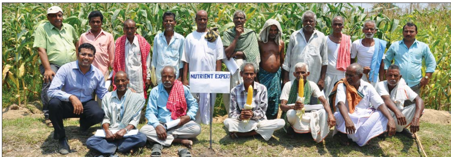
Odisha farmers expressed satisfaction after visiting the Nutrient Expert® plot.

ha, respectively ( Table 2 ). Across all sites, on average, NE reduced N, P 2 O 5 and K 2 O rates by 27, 33, and 21 kg/ha over FP, resulting in a rate reduction of 14, 40, and 20% of N, P 2 O 5 and K 2 O use, respectively. NE recommended slightly higher N rates and slightly lower P 2 O 5 and K 2 O rates during rabi in comparison to the kharif. Nutrient rates generated through NE are based on the estimated yield response to NPK application and NE estimated relatively high N response in rabi season over the kharif season (data not shown). The mean yield response to application of N, P 2 O 5 and K 2 O during kharif were 3.9, 1.1 and 1 t/ha; whereas, the estimated responses during rabi were 5.2, 0.9 and 1 t/ha, respectively.