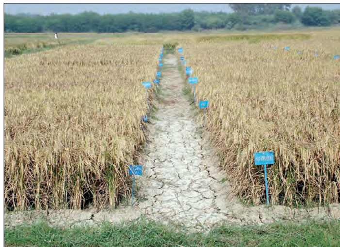
View of research plots.

New Delhi has a semi-arid and sub-tropical climate with hot and dry summers and cold winters. The mean annual rainfall is about 710 mm, most of which (about 84%) is received between July and September.