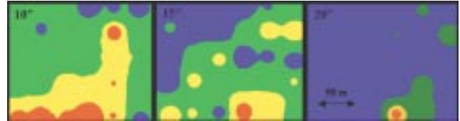
Figure 3. Compaction maps generated for three different depths (10, 15, and 20 in.). Compaction categories are delineated by color (light=blue, medium=green, high=yellow, heavy=red).

Hundreds of digital penetrometer profiles can be generated in a single day, dramatically improving the spatial sampling for mapping soil layers. If a global positioning system (GPS) is used while collecting digital penetrometer information then depth as well as the extent of the area requiring treatment can be determined. Figure 3 illustrates the type of compaction map that can be created. The map shows the horizontal and vertical distribution of compaction within a field. This information on the spatial distribution of compaction can help growers target areas for treatment or alter management practices. Hundreds of acres can be mapped in a single day in this way.