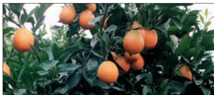
Production of navel oranges and other citrus from orchards in southern China could benefit greatly from improved soil fertility.