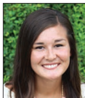
Ms. Croat United States