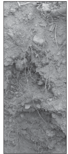
Are new genetics keeping corn roots alive longer to capture more soil N?

Nitrogen management affects not only the yield of the crop, but also the environment. Risks of nitrate in drainage water, ammonia gas transfer to forests and a possible contribution to smog, and nitrous oxide emissions related to greenhouse gases and ozone depletion all need to be considered. Each of these processes has different controls. Limiting one process can increase another.